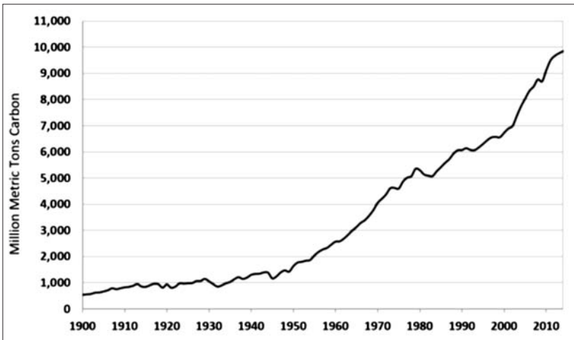
Figure 0.1. Global carbon emissions from fossil fuels, 1900–2014.